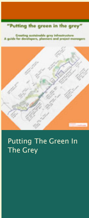
Putting The Green In The Grey