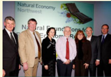
NENW Guest speakers at the November Lowry event.