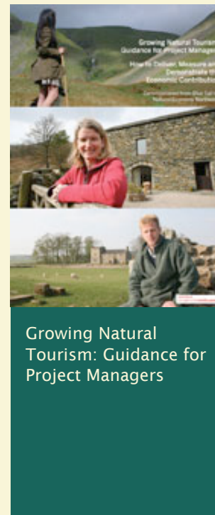
Growing Natural Tourism: Guidance for Project Managers

Natural Economy Northwest has recently published three new project guidance reports