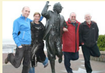
The Natural Economy Northwest team pictured in Morecambe.

Programme Director Natural Economy Northwest